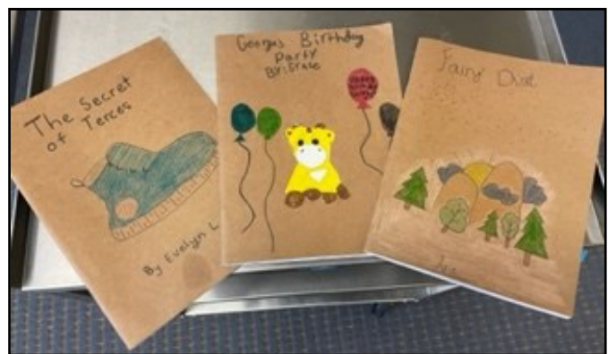
Cindy persuaded a few of her students to part temporarily with their books, so we could enjoy reading them. We were impressed with both their stories and illustrations. Some of the reviews written by other students were also fun to read.